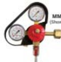
MM-12593 (Shown on 842)