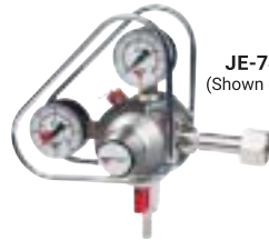
JE-742GCN (Shown on 842-PP)